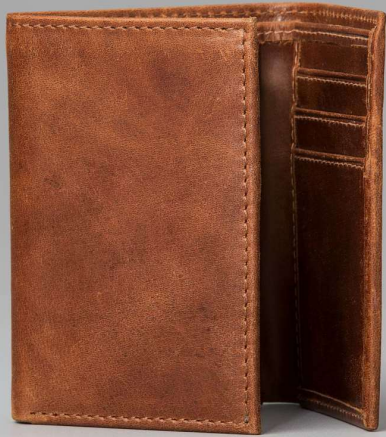
MW001-2-002750 Trip 4"x3.5" (folded size) Men's Trifold with 9 credit card slots, and 2 cash slot