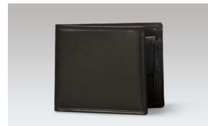
MW002-2-002750 Taut 5"x3.5" (folded size) Credit card slot- 7 nos, ID slot-1nos Coin pocket-1 Cash slot-2