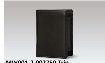
MW001-2-002750 Trip 4.75"x3.50" (folded size) Credit card slot- 8 nos, ID slot-2nos Zipped slot- 1, Coin pocket- 1 Cash slot- 2