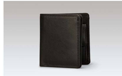
MW002-2-002750 Taut 5"x3.5" (folded size) Credit card slot- 12 nos, ID slot-1nos Cash slot-2