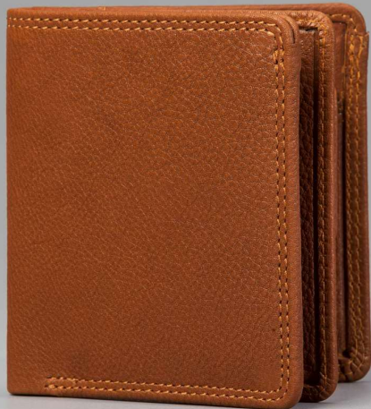
MW003-2-002750 Stout 4"x3.5" (folded size) Credit card slot- 8 nos, ID slot-1nos Coin pocket-1 Cash slot-2